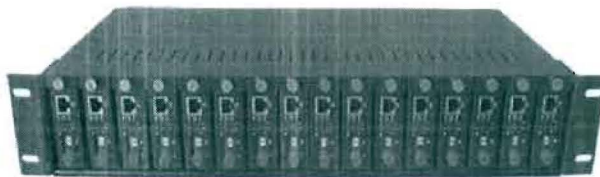
16 slots rack-mounted chassis

It can work stably and adapt broad width of voltage .It can store strong power and can be operated and managed easily. The maintenance of this chassis is also very easy. This option is the very one to meet the requirements of good stability, high capacity, good integration and good quality.